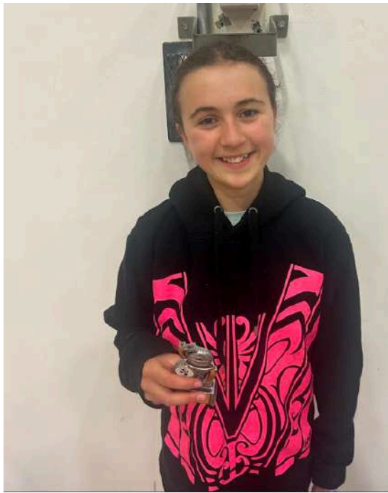
Congratulations Panda. Player of the day for the Pythons Netball Team