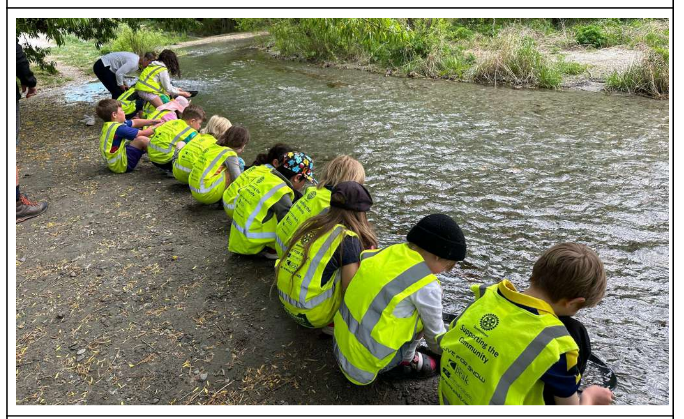
The Year 3 students had a fabulous time at camp this week. Thank you to everyone who made this camp a great success.