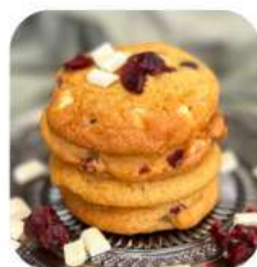
WHITE CHOC CRANBERRY