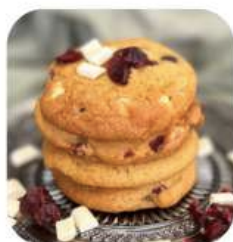
WHITE CHOC CRANBERRY