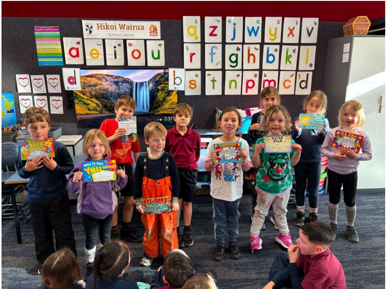
Congratulations to our award winners last week.